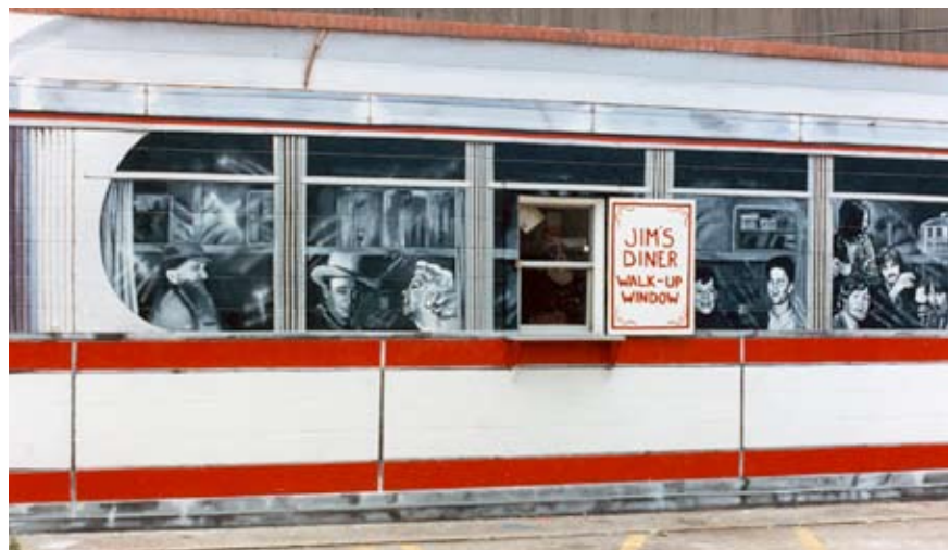
Jim's Diner was the original site of the Fry Street Mural. Portions of this historical mural are now permanently housed at the Center for the Visual Arts at the corner of Bell and Hickory in Denton.

April 30th at 6:00 pm. Center for the Visual Arts